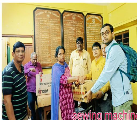
sewing machine to a needy lady